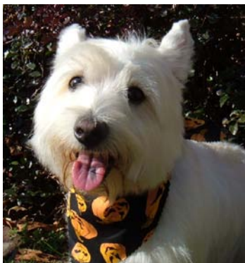
Heidi (in care)

Cooper, age 6 years, arrived because she was having problems with children. Ever since Cooper had ACL surgery, she has been sensitive about her knee and has started to nip at children - her owners believed she is afraid they will hurt it. The family has a six-month old baby and she is just starting to move around. Cooper has growled at her a few times. Also, the family was moving from their home to an apartment that does not allow dogs. Cooper will see a doctor to be sure there is not a problem with her leg and be treated if needed. Currently she is doing very well in foster care and is being observed to see if her legs seem to be giving her issues. So far we have not seen any nipping so possibly she just needs to be away from children.