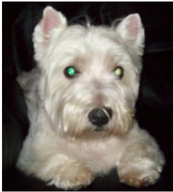
Casey (in care)

Casey, age 8 years, came to us after his family left him at a shelter due to what they called his "attitude". They said that he would pee any time they asked him to do anything. We took him to the vet and learned that he had bladder stones. After surgery, he recovered and was easily housebroken.