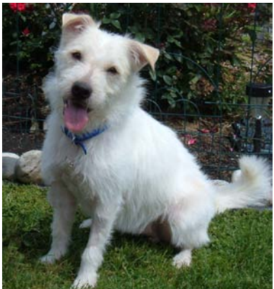
Oliver (fostered 38 days)

Oliver, estimated age 3 years, was yet another surprise. He was listed by the shelter as a purebred Westie. The shelter told us he had 24-48 hours to live. When we got there it was clear that this dog had a lot more in him than Westie but we couldn't leave him there to die. He was 27 pounds and very similar to Toby! We had him neutered and he also had to recover from kennel cough. The foster home found that he was terrified of riding in the car and he has a tendency to want to run. Otherwise, he was a very loving and sweet boy. (He was eventually moved to a mixed breed rescue where they were better able to find an adopter for this size of a dog and he has been adopted.)