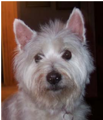
Roni (in care)

Roni, age 11 years, was surrendered by her owner when the owner lost her job and was forced to leave her home. She went to an apartment where dogs were not allowed. She tried to hide Roni but had to finally give her up. Her mom was heartbroken but there was no choice. If she was caught with Roni, she would have again lost her home.