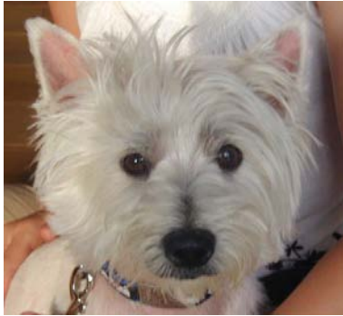
Rocky (fostered 73 days)

Rocky, age 3 years, was given up because he began to snap at children. We felt he was a case of neglect. He had lost much of his hair, yet had not been to the vet since 2006. When he was surrendered, the owner could not remember if Rocky had been fed yet that day!