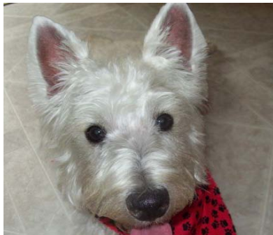
Dexter (fostered 31 days)

Dexter, age 1 year, came to us because the owner had no time for him. Dexter has some minor allergies but his personality shines. He has now been adopted.