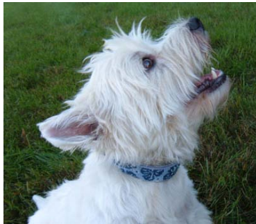
Reggie (fostered 25 days)

Fergus, age 6 months, came to us because the elderly lady who owned him was not able to handle him. (He and Mulligan came from the same litter of pups. The breeders are in Ann Arbor and this was their 2 nd Westie litter.) Fergus is more settled than Mulligan but, at first, did need to be reminded that he is not boss. Fortunately, he was able to adapt and learned to live nicely in a family and with another dog. After a few weeks of foster care, his foster home decided to adopt.