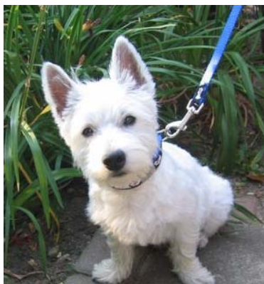
Mulligan (fostered 33 days)

Dexter, age 1 year, came to us because the owner had no time for him. Dexter has some minor allergies but his personality shines. He has now been adopted.