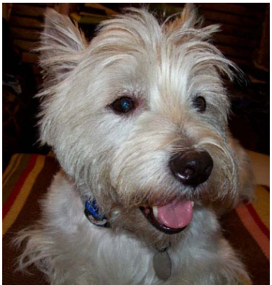
Winston (in care)

Oliver, estimated age 3 years, was yet another surprise. He was listed by the shelter as a purebred Westie. The shelter told us he had 24-48 hours to live. When we got there it was clear that this dog had a lot more in him than Westie but we couldn't leave him there to die. He was 27 pounds and very similar to Toby! We had him neutered and he also had to recover from kennel cough. The foster home found that he was terrified of riding in the car and he has a tendency to want to run. Otherwise, he was a very loving and sweet boy. (He was eventually moved to a mixed breed rescue where they were better able to find an adopter for this size of a dog and he has been adopted.)