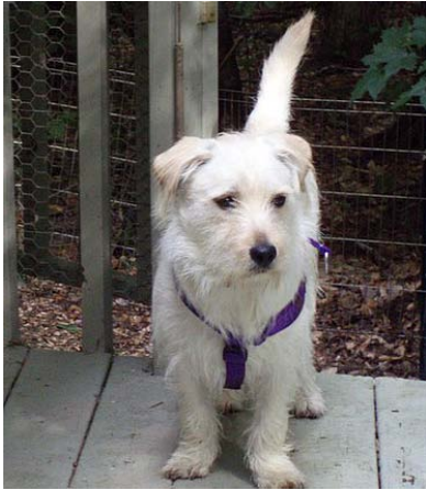
Toby (fostered 47 days)

Toby, estimated age 1 year, was quite a surprise for us. He was in a northern shelter. We knew he was a mix but didn't expect what we got! He weighs about 35 pounds. While he has Westie in him, the mix is strong. Toby is a very friendly, happy and bright young fellow who aims to please. He has been adopted by his foster family which includes a Westie who was adopted several years ago.