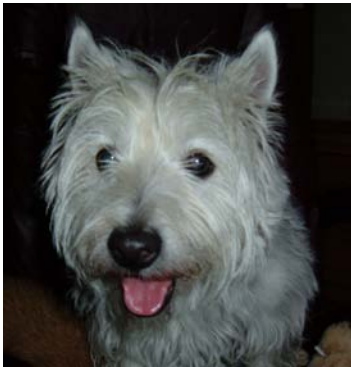
Cooper (in care)

He looked like he had lost 10 pounds once he was groomed. What a handsome dude under all that hair! He also had advanced dental disease and feels so much better after his dental work. He has changed from a "touchy" boy with housebreaking issues to a fun-loving little boy whose only issue is a growl when he is picked up. (Not unusual for many Westies.) He just needs a family who will recognize his medical needs and take care of them if anything crops up and which has some Westie experience so they won't be intimidated by the growl.